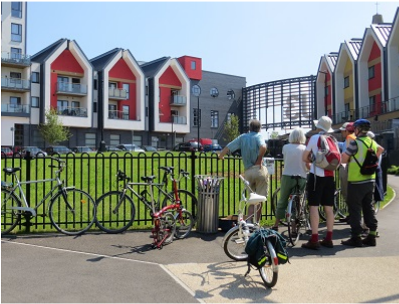
Joint event with Bristol Civic Society. Environmental award winning Buildings. May 2014.

The following photographs show a broad selection of Rides completed during the grant award period