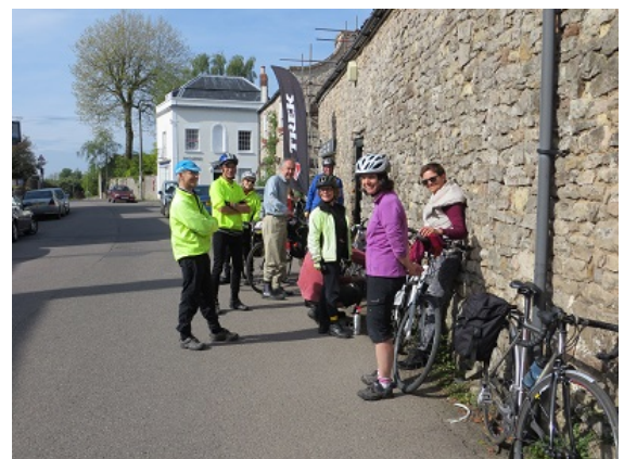
Severnvale Ride. May 2014