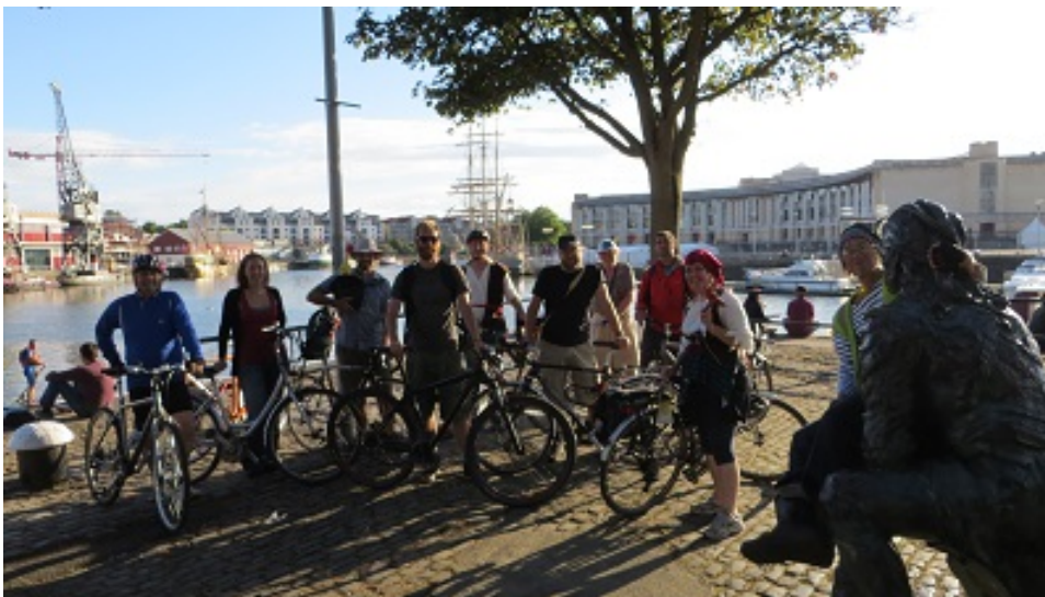
Bristol Cycle Festival. Pirates and Sailors Ride. July 2014