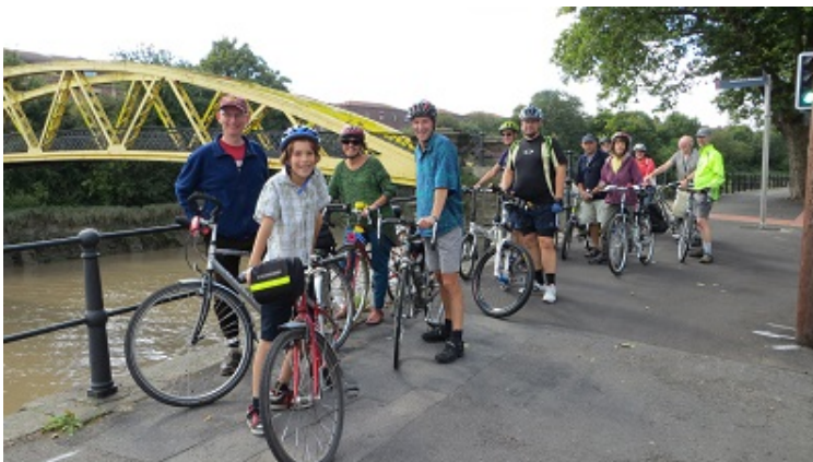
Weird Sreet Names of Bristol Ride. August 2014